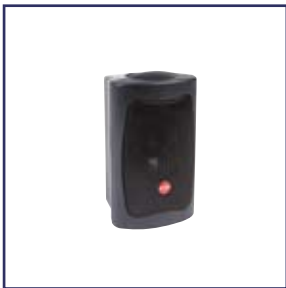
● Smart 300 VHF (10W)