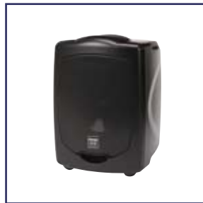
● Focus 505 UHF (30W)