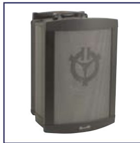
● Challenger 1000 UHF (50W)