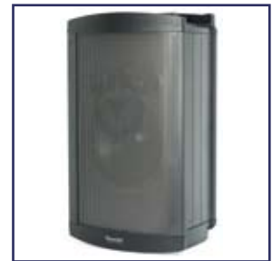
● Victory 2000 UHF (75W)

Our portable PA systems are available with a full range of microphone/transmitter options including handheld, tieclip, collar and head worn. (Please Note: Focus 500 Infrared Model is not suitable for outdoor use. For outdoor applications, please specify UHF models).